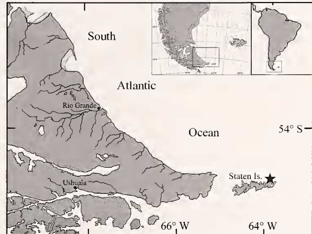
Figure 13. Map showing the type locality (★) of Pelseneeria sudamericana Pastorino & Zelaya, sp. nov.

Apparently there is no obvious host specificity for species of the genus Pelseneeria around the world (see Table 2). Pelseneeria hawaiiensis parasitizes echinoids of the genus Aspidodiadema Agassiz, 1879, which belongs to a different order than Heliocidaris Agassiz & Desor, 1846, which is the host of the Australian P. brunnea (Tate, 1889). However, P. sudamericana parasitizes the only